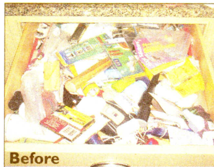
Small bins and baskets are the perfect tool for organizing a "junk" drawer.